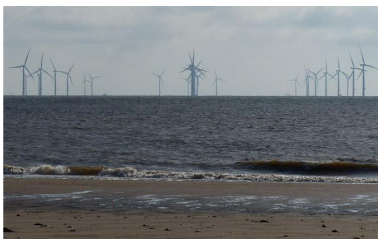
Figure 2 170m wind turbines, 8km from shore.

Yes, a study released by the Welsh government in 2019 (2019 Wales Seascape and visual sensitivity study (source)) would have 200m wind turbines within 12kM from shore has being "above medium impact"